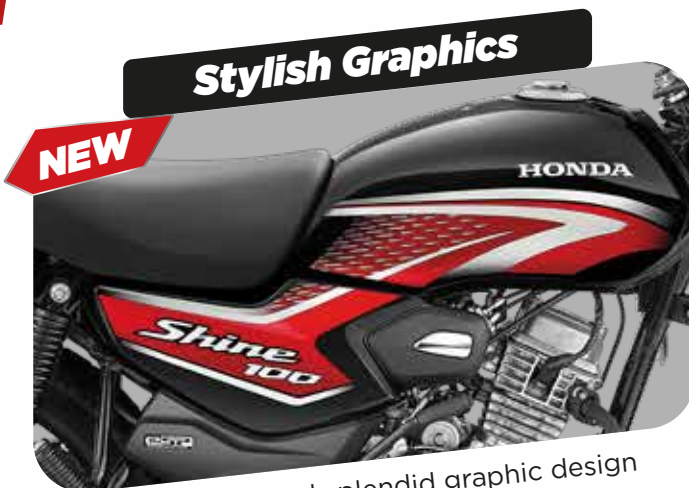
All new enriched and splendid graphic design that compliments the overall look of the bike.