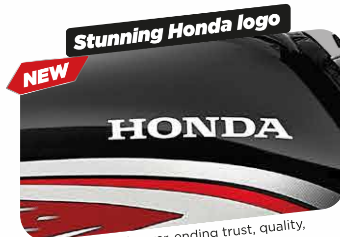
The symbol of never-ending trust, quality, and reliability.